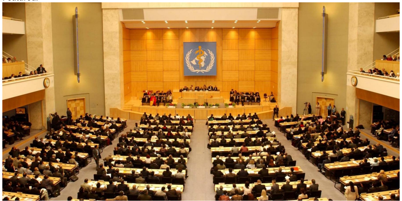
Event end date: Saturday, 26 May, 2018 Is this an NCD Internal Event?:

Tags: world health assembly [28] Featured: