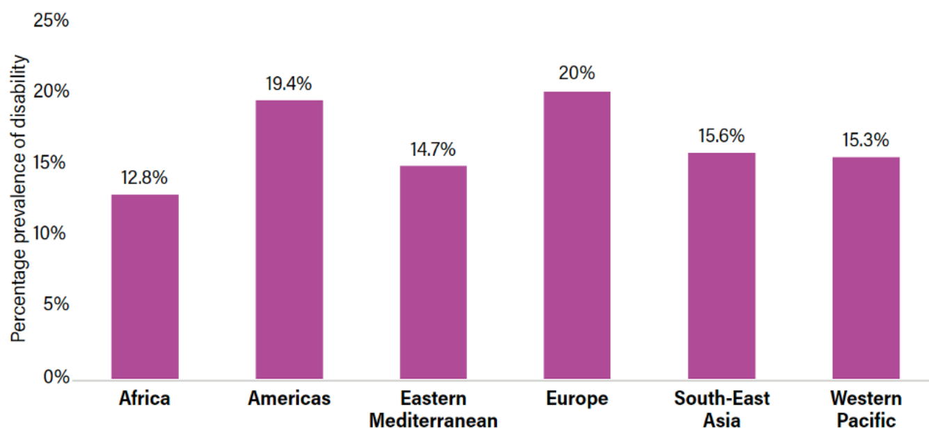
Figure 2. Prevalence of disability, by WHO region, 2021