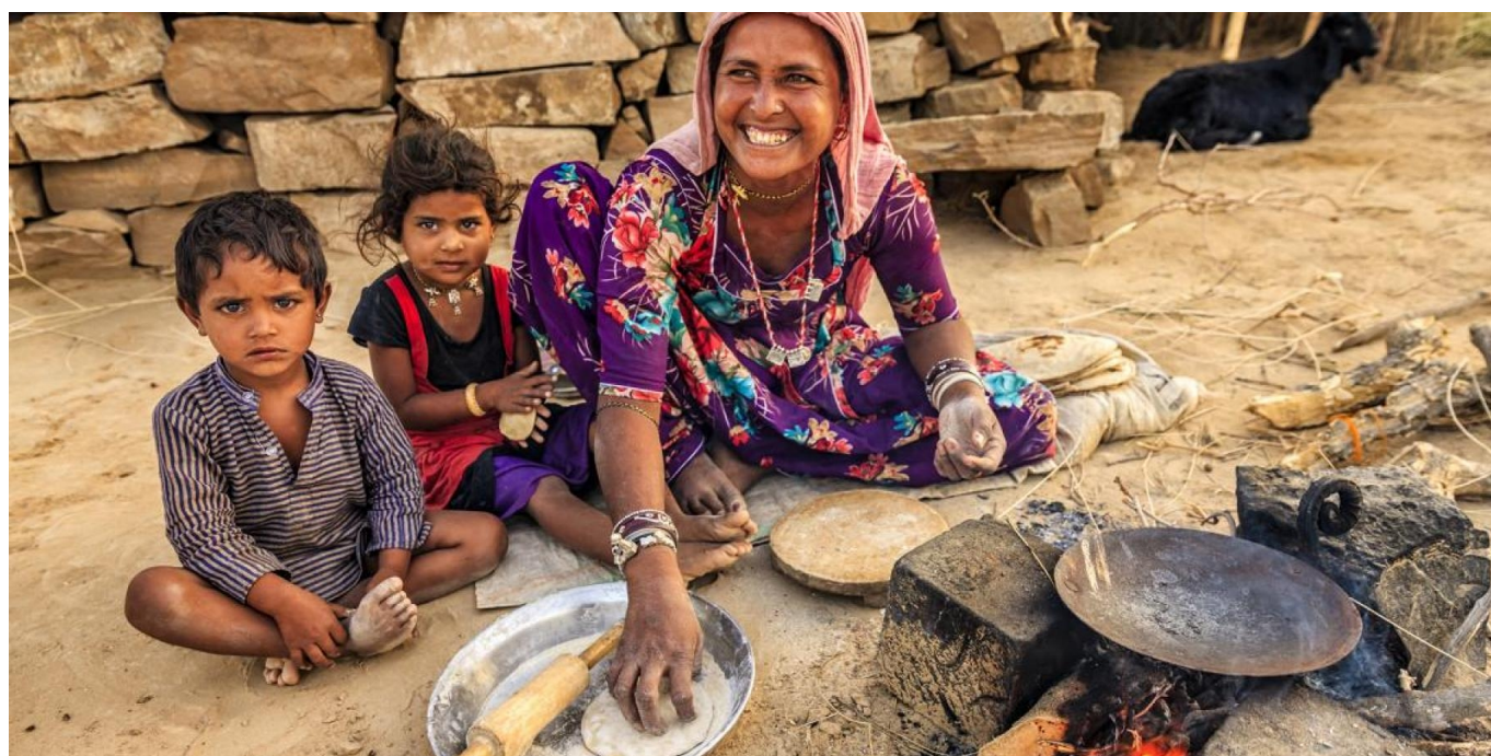
Manifesto on the Double Burden of Malnutrition, cover photo

More than one in three low- and middle-income countries face both extremes of malnutrition, according to a new The Lancet Series on nutrition launched on 16 December 2019.