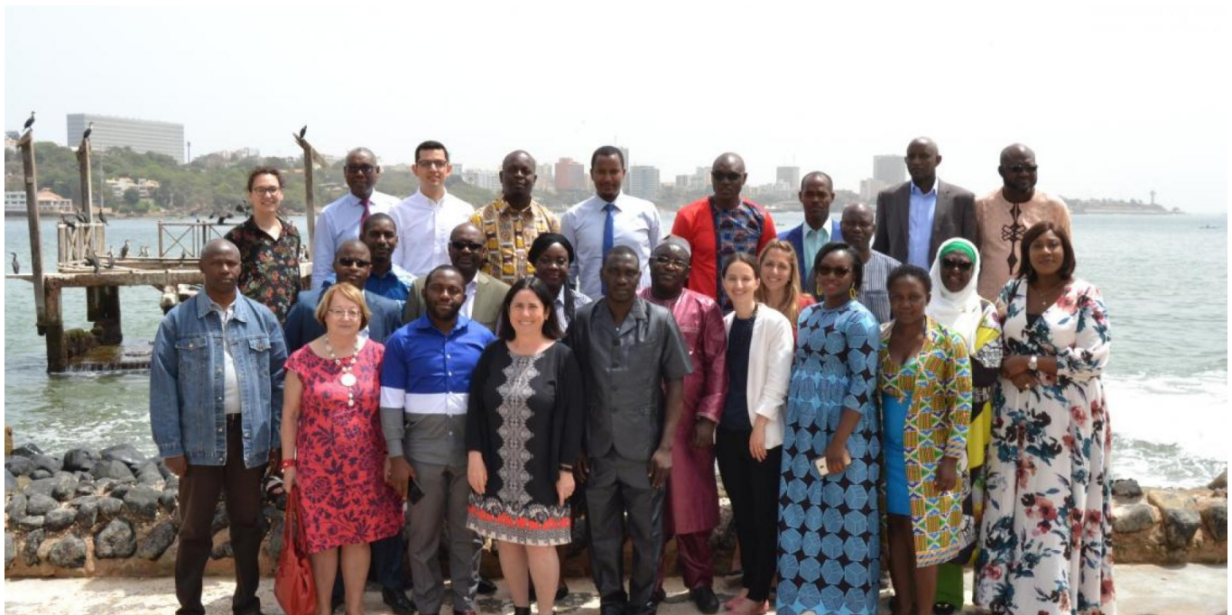
Participants of the Regional Workshop on NCDs organised by the NCD Alliance in Dakar, Senegal, in June 2019

Over 15 representatives of civil society organisations from Francophone Africa adopted the Dakar Declaration on noncommunicable diseases (NCDs) last week, committing to joining forces to fight NCDs in the region.