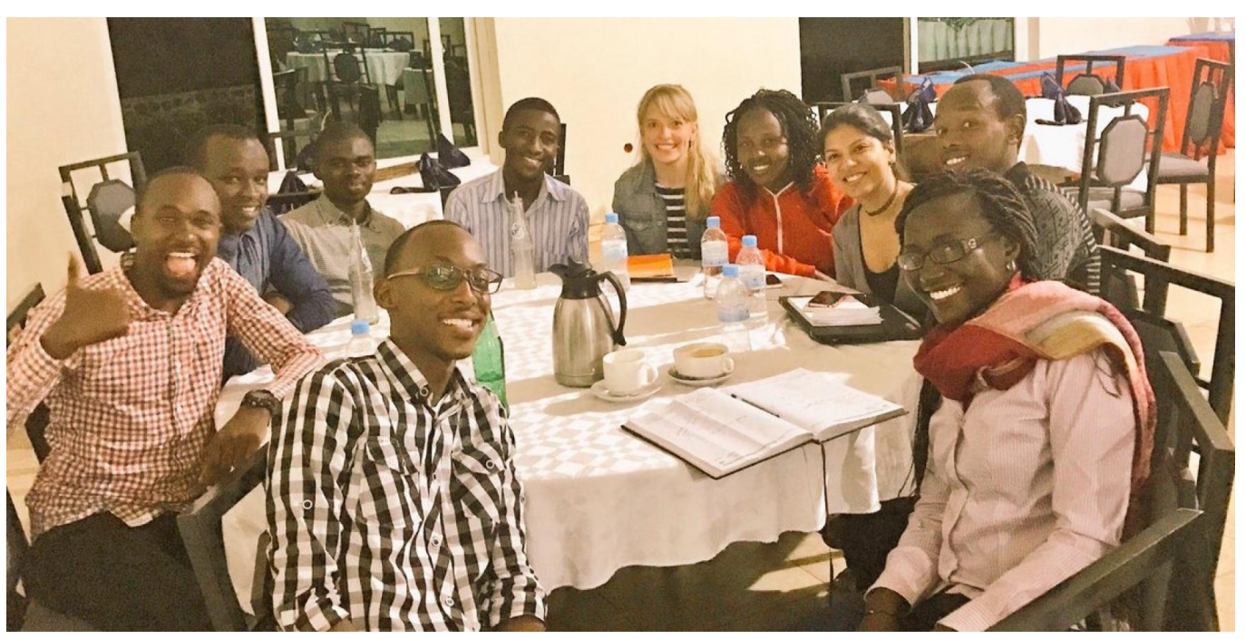
#NextGen4NCDs organising team preparing an unforgettable workshop in Kigali

This May 4-7, 2017, the Young Professionals Chronic Disease Network (YP-CDN) and RTI International will host a NextGen Leaders for Noncommunicable Diseases (NCDs) workshop in Rwanda.