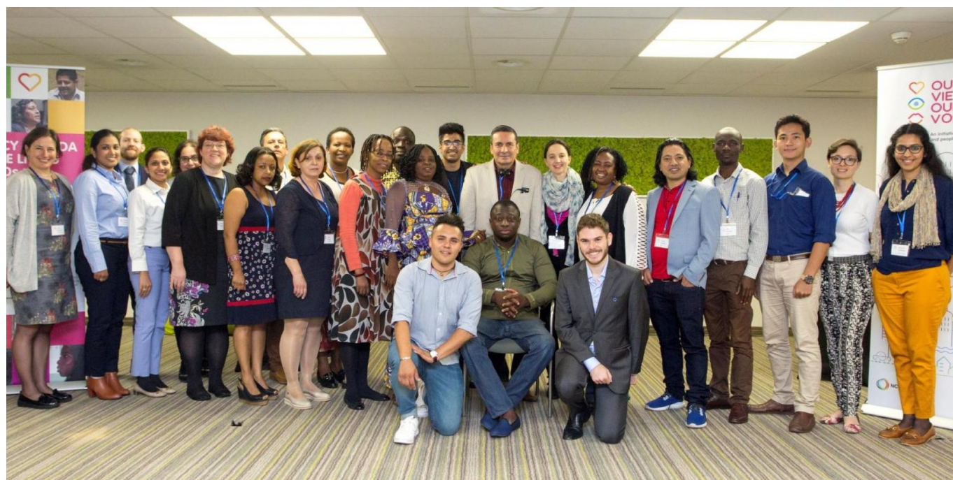
'Family photo' from the Our Views Our Voices training of people living with NCDs, ahead of the 71st World Health Assembly.

On 17-18 May, 19 people from 13 countries living with NCDs came together in Geneva to attend the Our Views, Our Voices [1] 2018 training workshop.