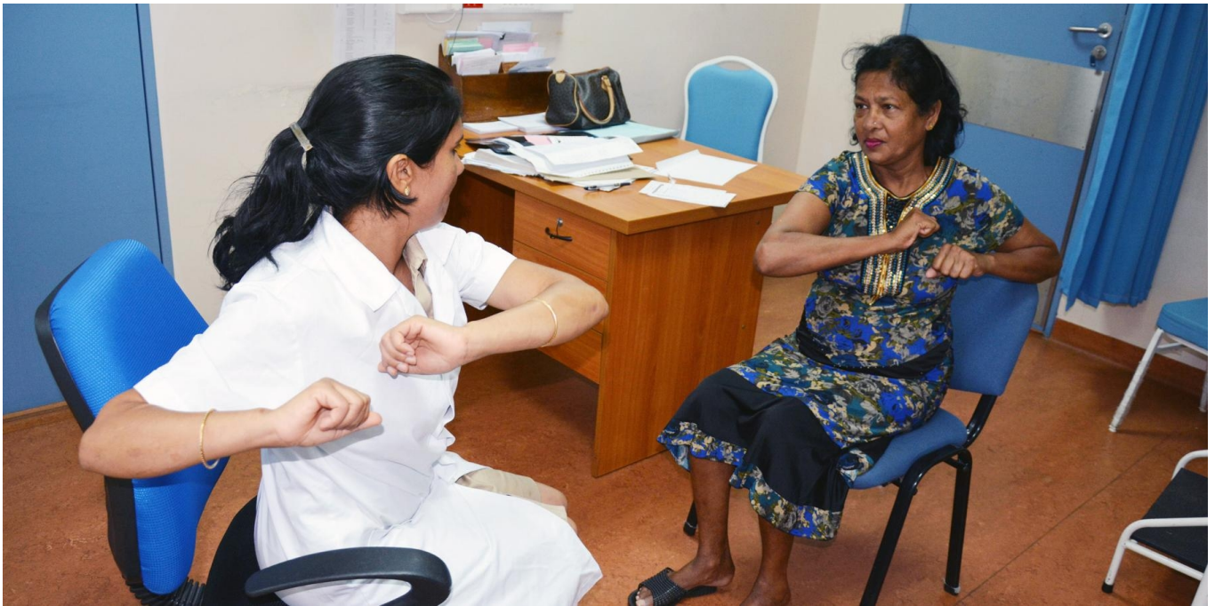
A Diabetic Specialist Nurse in Port Louis, Mauritius, teaches a patient simple limb exercises.